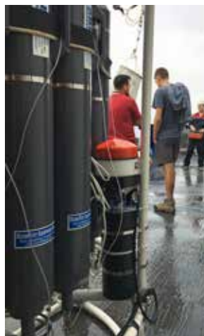
SeaGuardII with Oxygen, Salinity, Temperature, Depth and Current sensors used for water column profiling from ships cabled CTD system