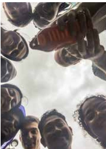
CastAway selfie

Instrumentation from Xylem was used both during a one day expedition at sea with the new Xiamen University research vessel Tan Kah Kee: Aanderaa SeaguardII with Oxygen Optode , YSI EXO2 with Oxygen Optode and CastAway and in the laboratory work WTW oxygen lab systems .