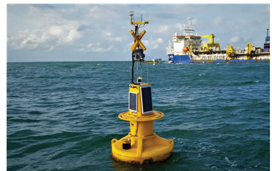
Figure 2. MOTUS Wave Buoy at Paranaguá Port