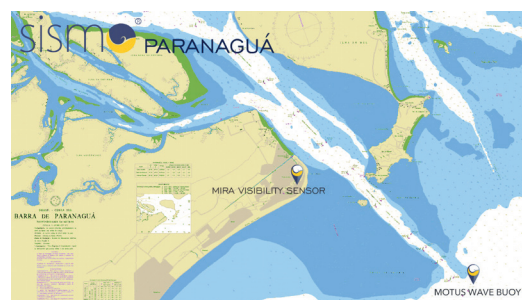
Figure 3. Paranaguá nautical chart

The actors' reputation (HidroMares in Brazil and Aanderaa worldwide) Previous successful projects with other Brazilian Pilot Associations Real-time monitoring system to provide safe navigation Advantages of a buoy solution – all sensors in the same station, surface based station with little need of diving Quality proven sensors that are suitable for a buoy solution ( MOTUS and DCPS ).