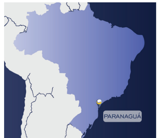
Figure 1. Location of Paranaguá Port, Brazil

HidroMares provides a turnkey solution with system integration, sensors maintenance, data transmission and quality analysis, together with Aanderaa's experience and support.