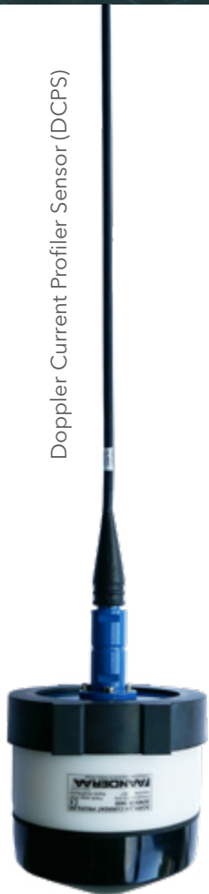
Doppler Current Sensor (DCS)