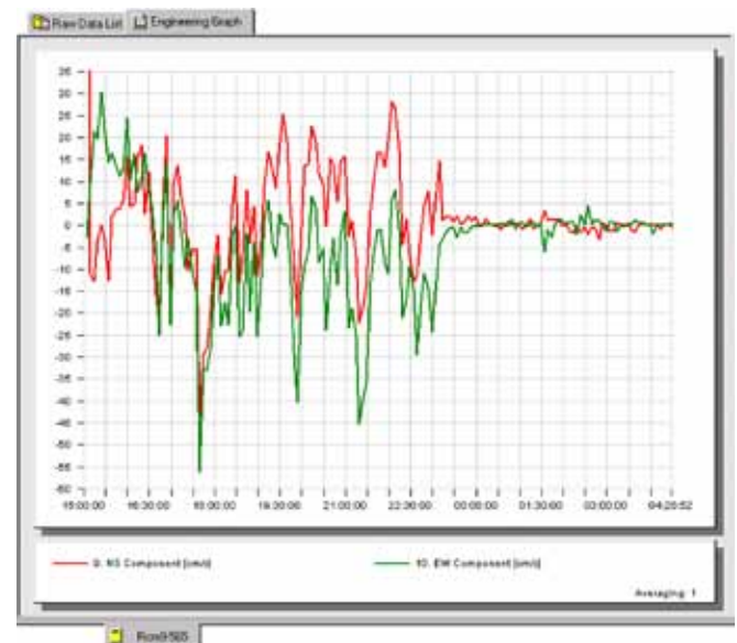
Engineering Data Graph from Data Reading Program 5059

The Data Storage Unit (DSU) is a portable, reusable, solid state module for storing data in the 10-bit PDC-4 code.